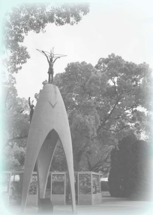
The Children's Peace Monument

Compared to the US, the spread of information about Hiroshima to Europe is still not extensive. But, if we only look at the case of West Germany, we can find some examples of the interest of Europeans about Hiroshima. In the 1950s a research delegation working to understand the influence of the A-bomb on mankind visited Hiroshima from Frankfurt am Main. Many things, such as a pipe organ, were donated to the Memorial Cathedral for World Peace in Noboricho from several West German cities. It showed the interest of European people in Hiroshima.