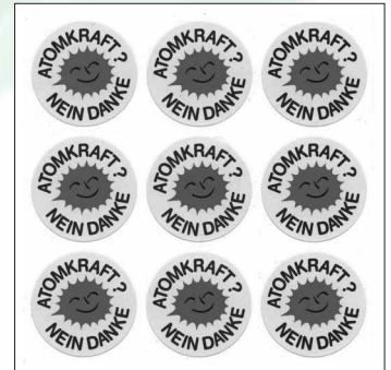
The globally recognized anti-nuclear logo, the Smiling Sun. (Above is a German version.)